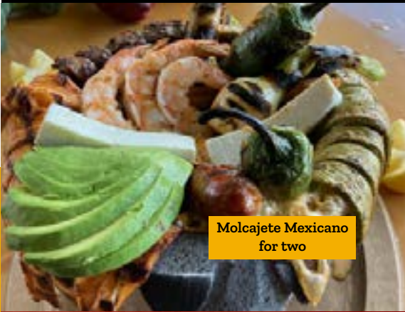
Molcajete Mexicano for two